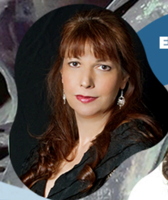
Elaine Rinaldi Conductor